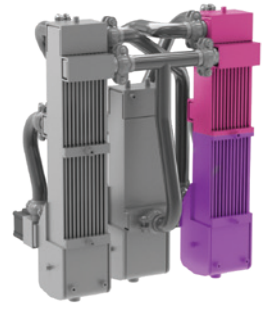
Air heat energy regenerate the chamber and as the defrost occurs the air temperature is also lowered and further dried.