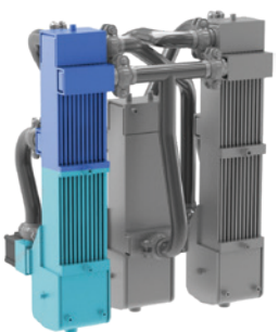
Sub Zero Deposition chamber at -20°PDP (refrigerant-air heat exchanger)