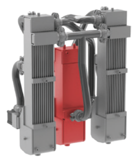
Common Precooler - removes 85% of the moisture from the air.