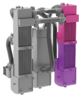
Air heat energy regenerate the chamber and as the defrost occurs the air temperature is also lowered and further dried.