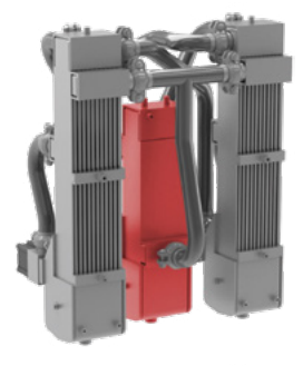
Common Precooler - removes 85% of the moisture from the air.