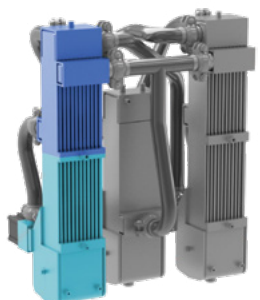
Deposition chamber at -20°PDP (refrigerant-air heat exchanger)